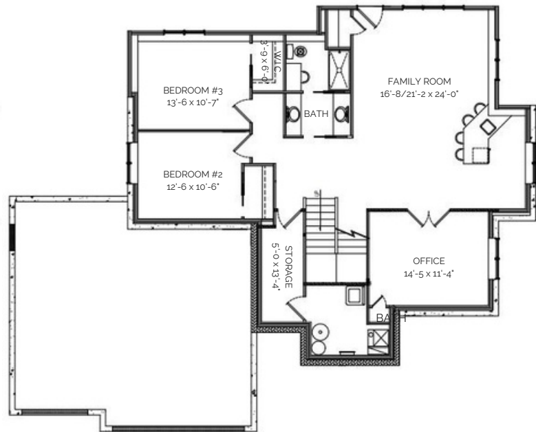
Main Floor 1608 Sq Ft