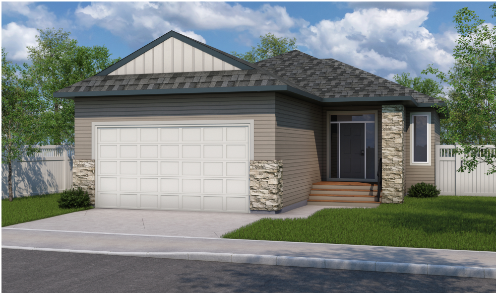
Image is a rendering only, exterior style, actual square footage, features, and details may vary.