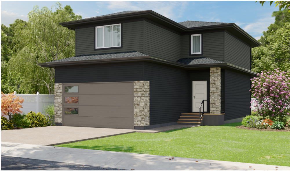
Image is a rendering only, exterior style, actual square footage, features, and details may vary.