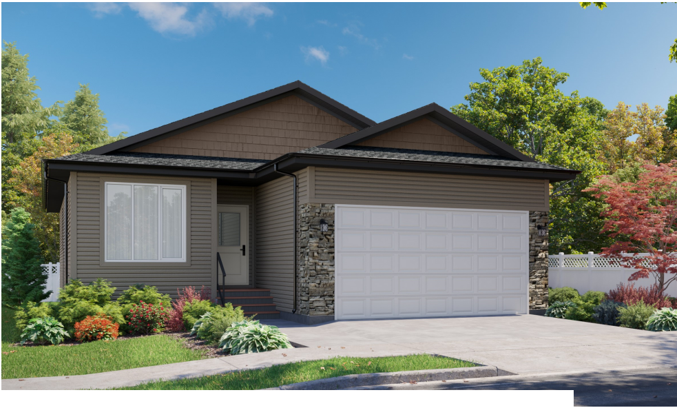
Image is a rendering only, exterior style, actual square footage, features, and details may vary.